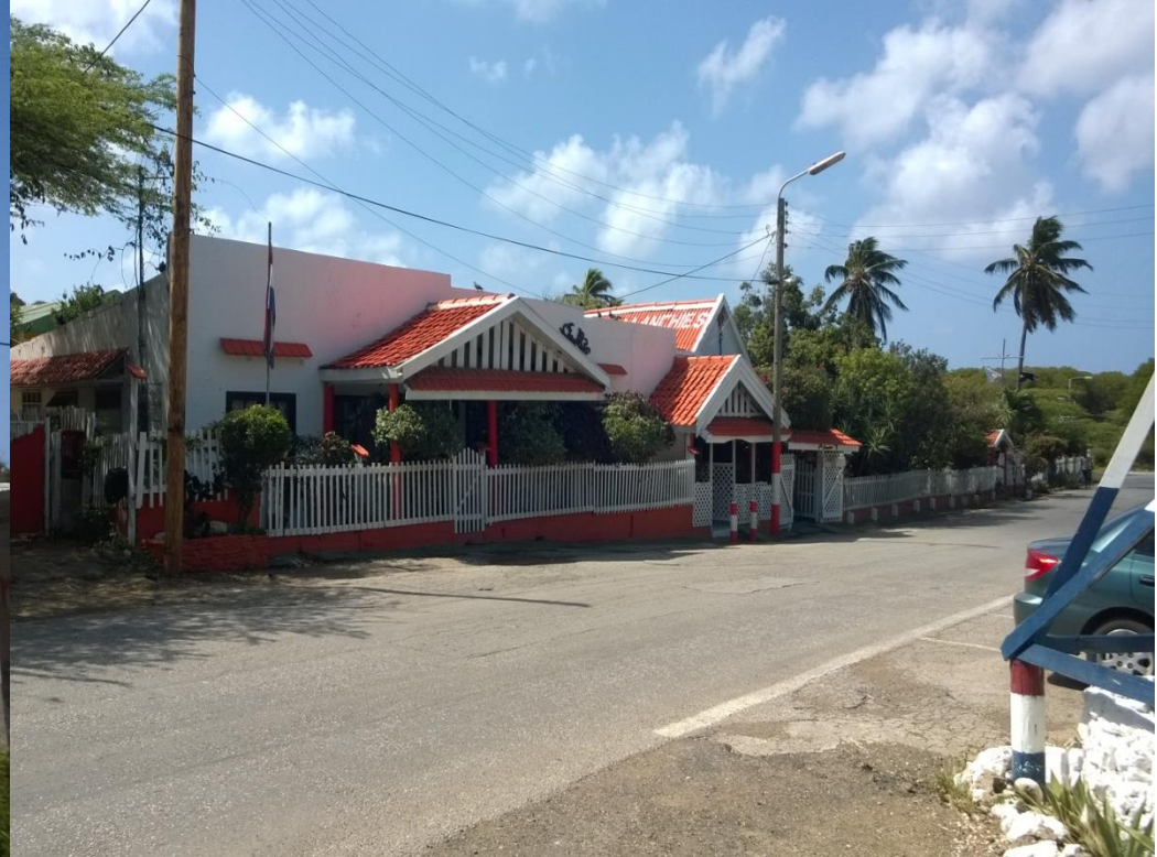
Jaanchies Restaurant (top) Old Soccer Field (below)