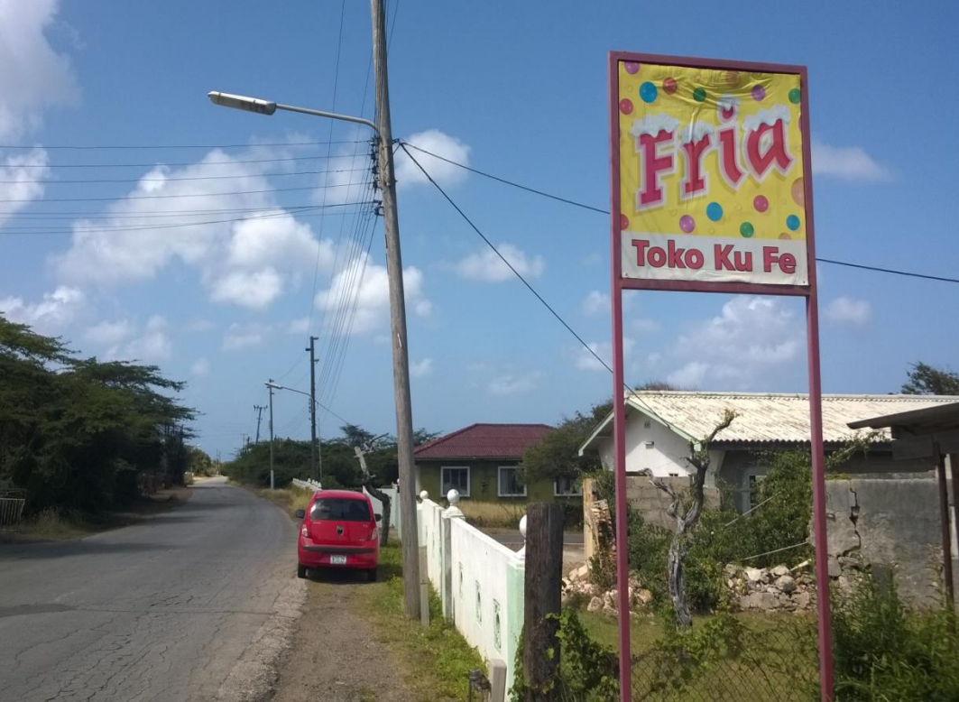
Toko Ku Fe (top) Jaanchies Road (below)